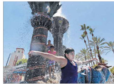
CHILDREN SPLASH in delight as water pours from the Fountains of Life in Cathedral City. Southern California's best view, part of the Four Corners High weather system, was forecast to peak Tuesday.