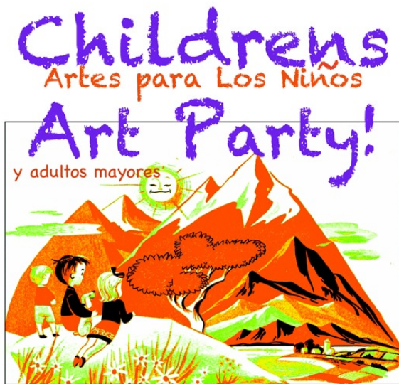
Illustration by CC Cove artist, Val Samuelson, from "Music Round The Town" (1955)