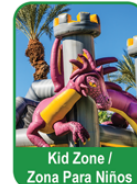
Kid Zone / Zona Para Niños