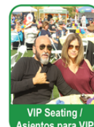
VIP Seating / Asientos para VIP