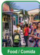
Food / Comida