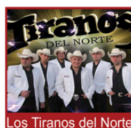
Los Tiranos del Norte