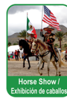
Horse Show / Exhibición de caballos