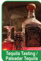
Tequila Tasting / Paleadar Tequila