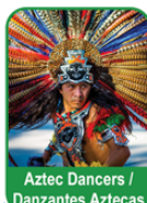
Aztec Dancers / Danzantes Aztecas