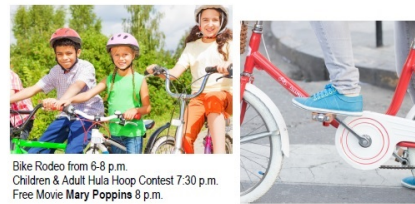
Bike Rodeo from 6-8 p.m. Children & Adult Hula Hoop Contest 7:30 p.m. Free Movie Mary Poppins 8 p.m.

The City of Cathedral City and S.C.R.A.P. Gallery invite you to celebrate National Bike Month