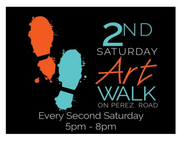
ARTtastic! Read more.