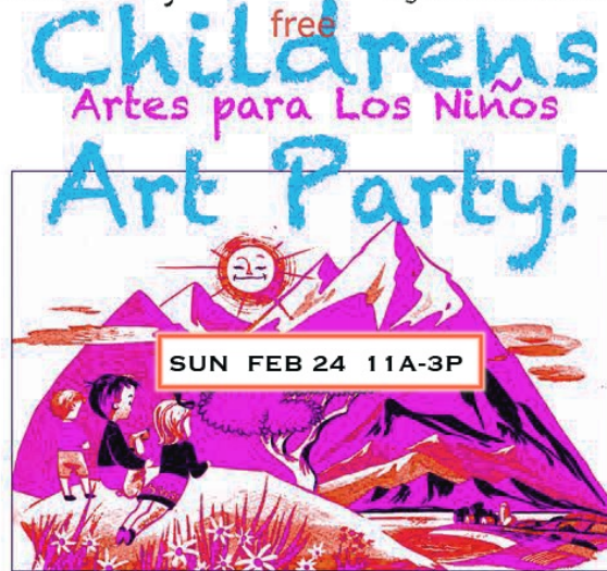
Illustration by CC Cove artist, Val Samuelson, from "Music Round The Town" (1955)