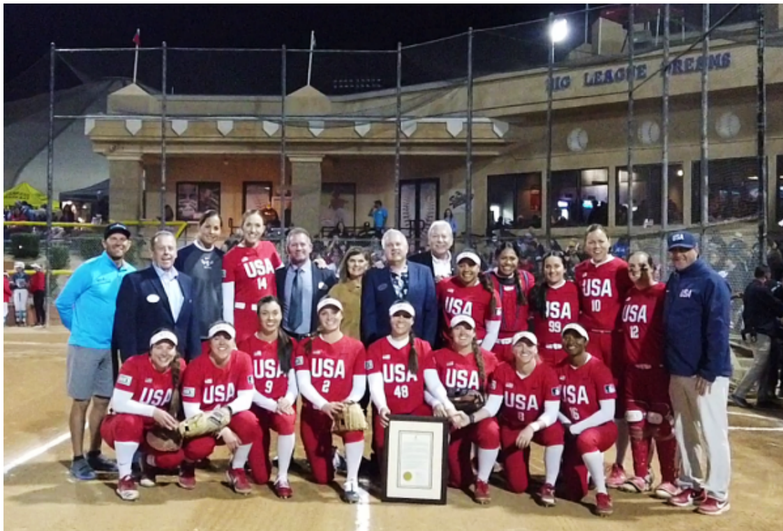
City Council Welcomed Team USA to Cathedral City